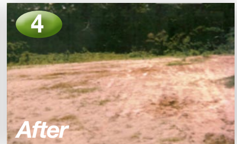
June 1, 1993 (52 Days Later) New Vegetation Growing On Site! Total Hydrocarbons: 3,380 ppm (avg.)

The Mantis proprietary bioremediation process utilizes beneficial microbes and patented, environmentally friendly plant or vegetable waste cellulose to decompose contaminants and transform them into harmless byproducts — water and carbon dioxide.