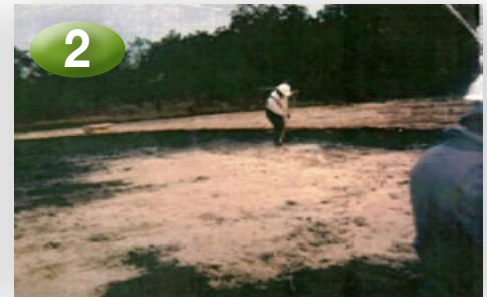
April 9, 1993 Applying Mantis Absorbent