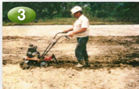
April 9, 1993 Tilling Mantis Absorbent Into Site