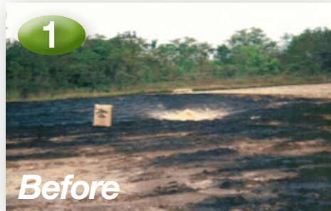
April 9, 1993 (Original Site Condition) Affected Area: 95 ft. x 75 ft. x 1 ft. deep Total Hydrocarbons: 60,000 ppm (avg.)

Remaking Drilling Mud Into Prairie (Alvin, TX - 1993)